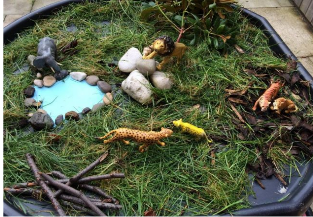
Safari play tray with sand/grass and animals