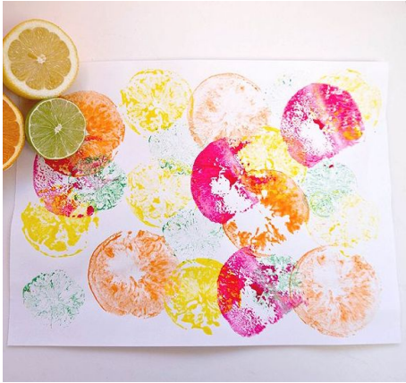
Fruit printing with paint