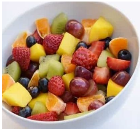
Making a fruit salad