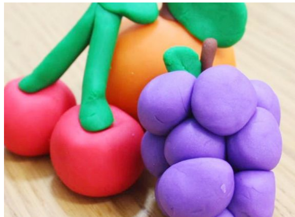
Use playdough to make fruits