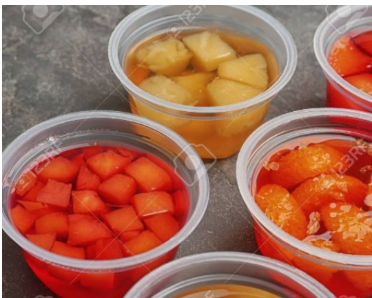
Make jelly and add fruit