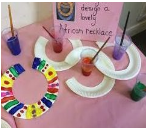
Design an african necklace