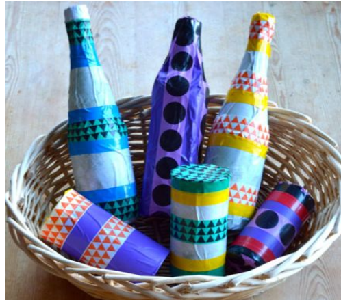
Make and design a shaker