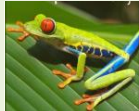
Poison Dart Frog

The tropical rainforest has many kinds of creatures. Here a few for you to find some more about. You can use the internet. Please use adjectives in your answers. Adjectives are describing words.