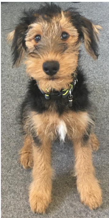
Miss Honey joins Woodside

Over the last nine years The Dog Mentor programme has been proven to have a positive impact on children in all areas including self-esteem, behaviour, peer relationships and better engagement skills. These improvements then result in improved achievement.