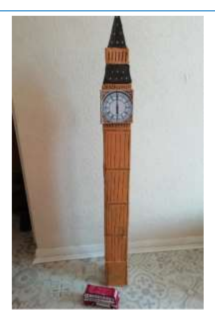
A fabulous model, of 'Big Ben' and a London Bus, made by a Woodside pupil.