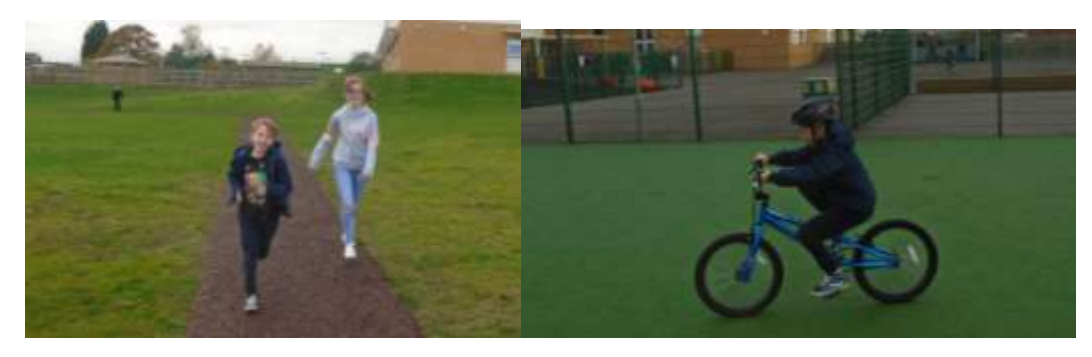
More from Children in Need Across the school.