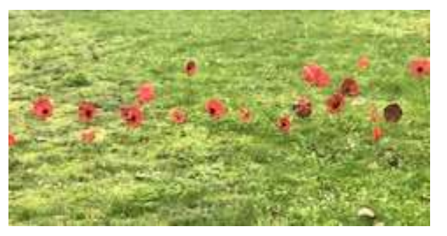
Sunflower Class artwork